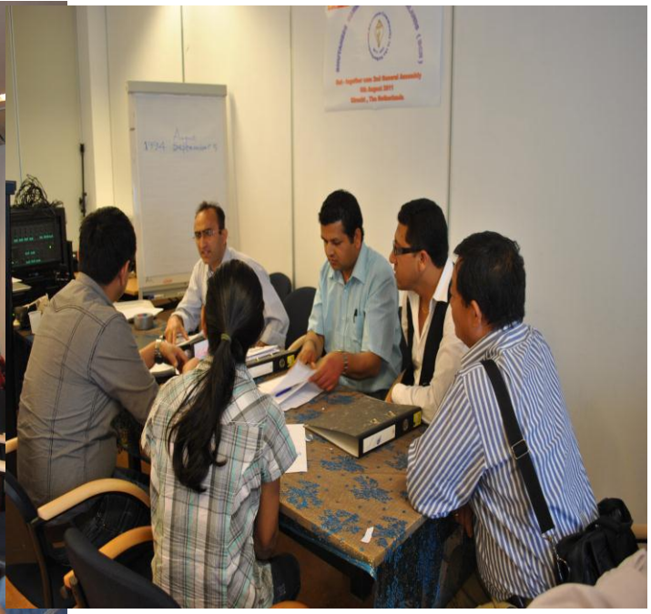
BCN new team receiving documents from former team