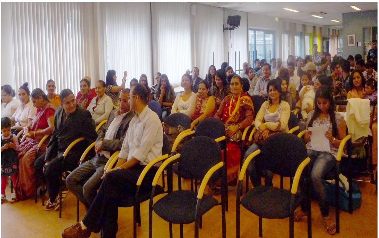
Audiences of the Day

Around 150 Bhutanese living in different parts of the Netherlands have shown up at the programme. This is the highest number of participation from our community so far since the establishment of BCN in 19 th September 2009.