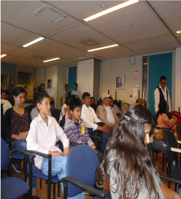
Participants Observing Cultural Programme

Some other pictures of 6 th Augusts 2011