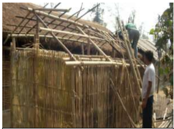
A fire-gutted hut under construction at the time of distribution of cash grants to victims.

For addressing the victims in need, the following criteria were adopted in a meeting with camp committee representatives and other volunteers in order to distribute cash donations from GHRD and BCN.