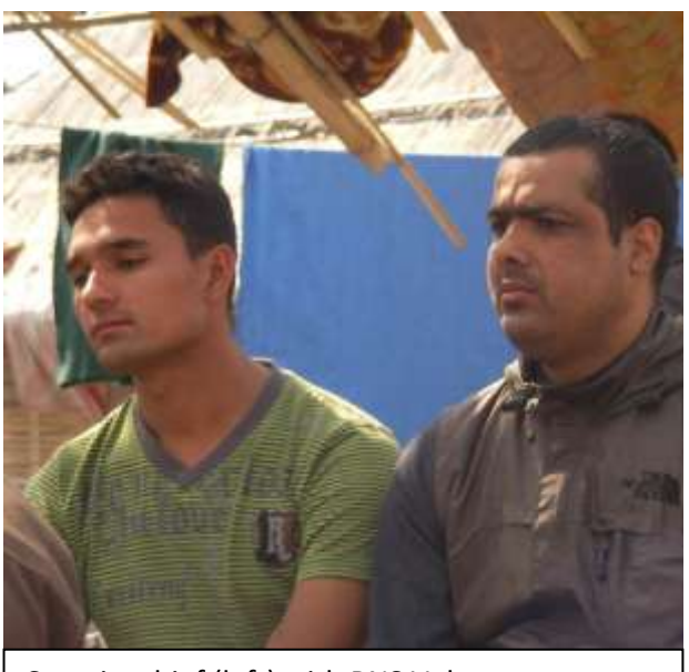
Security chief (left) with BNS Volunteer